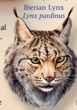
Iberian Lynx Lynx pardinus

The National Park of Monfragüe comprises an area of 18.396 ha. stretching along the river Tagus, and surrounded by large extents of oak-covered parkland (dehesas), being an unique refuge for the most representative species of the Mediterranean wildlife. Due to its well preserved woodland and scrubs and to the presence of endangered fauna, this is a great treasure of biodiversity, and one