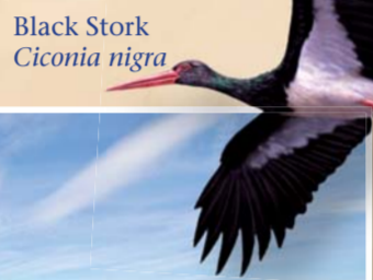
Black Stork Ciconia nigra

of the most remarkable areas for nature in Europe