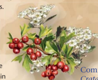
Common Hawthorn Crataegus monogyna

Malpartida de Plasencia, in the road from Villarreal de San Carlos to Plasencia. Free camping is not allowed in any other place.